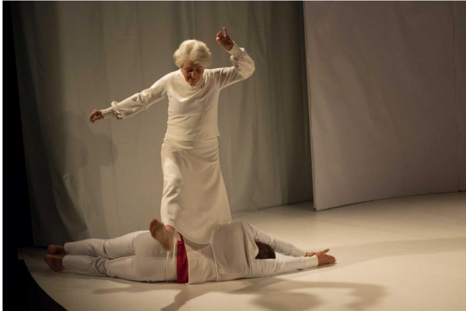
« en UN éclat »

« I often felt from the depth of my soul a need to find this spiral position again. I bent down to write. So I could write about the child I felt in one burst, the child I felt from afar, the child who is becoming a memory lost in the maze of a child's body ».