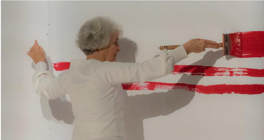
« en UN éclat »

The first one is tempted, with the second's help, to meet again in ONE burst (« en UN éclat ») this spiral posture (“Colimaçonne”). The second one wants to leave it.