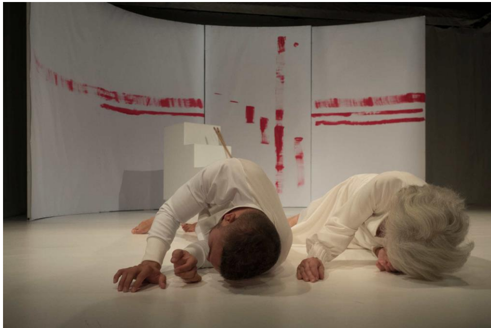
« en UN éclat »