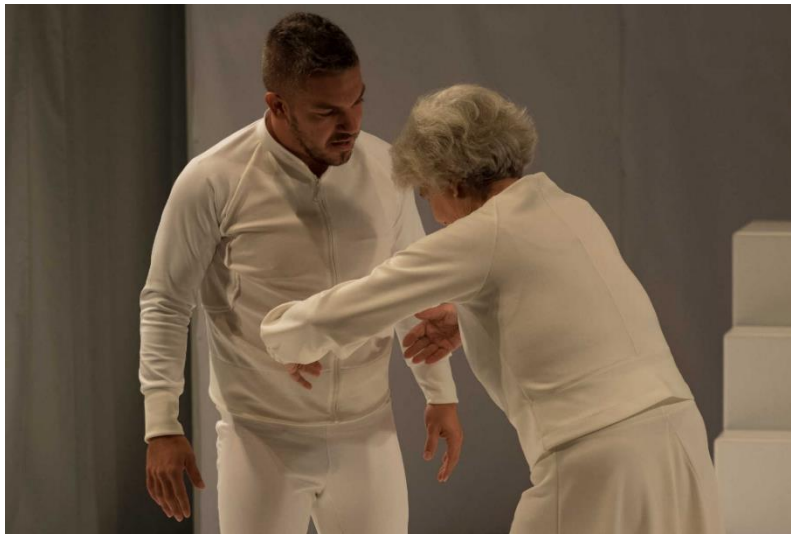
« en UN éclat » - © Dominique Vérité

The first one is tempted, with the second's help, to meet again in ONE burst (« en UN éclat ») this spiral posture (“Colimaçonne”). The second one wants to leave it.