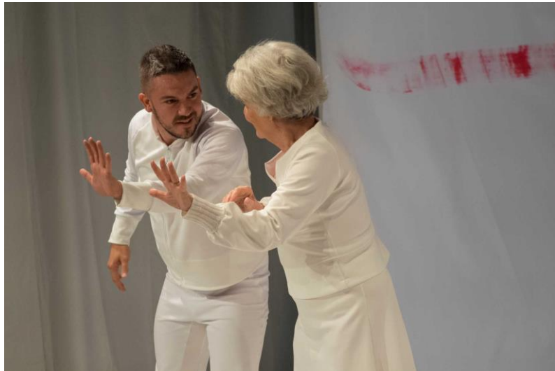
« en UN éclat » - © Dominique Vérité